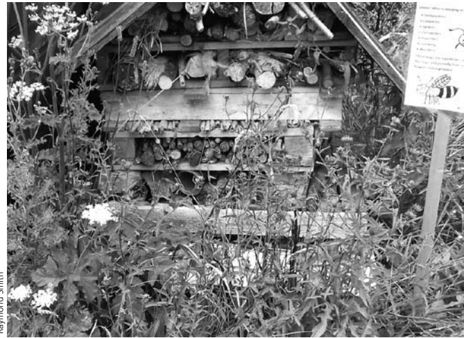
The bug 'mansion' in Normandy Therapy Garden Inspiration for the future

It was an inspiration to see how the Therapy Garden in Normandy was helping people with mental and physical disability through working with nature.